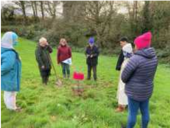
Planting of the Hindu Tree