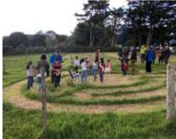
Celebration of Eid with the Islamic Community