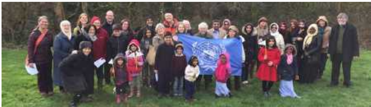
Reading the Jewish Prayer on the Peace Pole